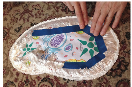
STEP 4: You can use masking tape to help secure the fringe. You will also need to pin it around the edges.