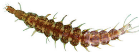
whirligig beetle larva