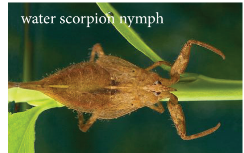
water scorpion nymph