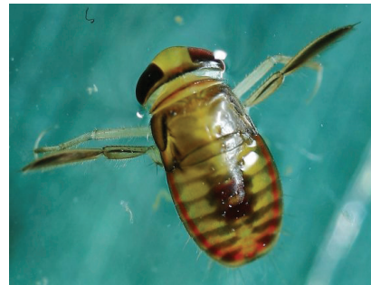
water boatman nymph