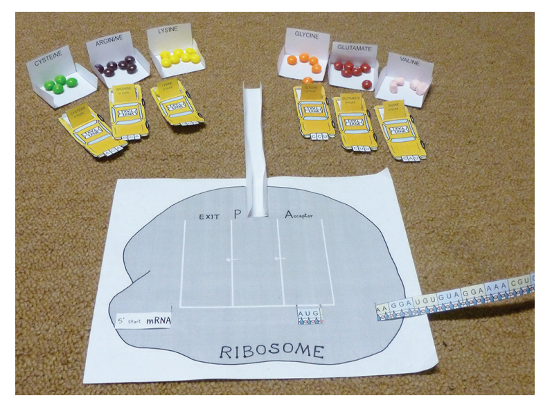
General set up. Two (or three?) players can share a set of taxis.

Put a token in each trunk to start. Taxis are to be shared, so put them in the middle where everyone can reach them. When a trunk gets emptied it will need to be refilled from the supply pile.