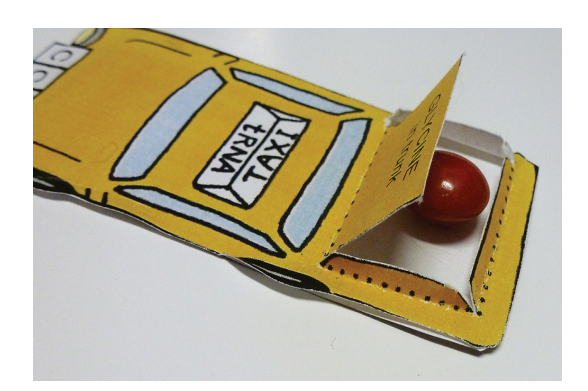
Assembled taxi with "amino acid" in trunk ready to go.